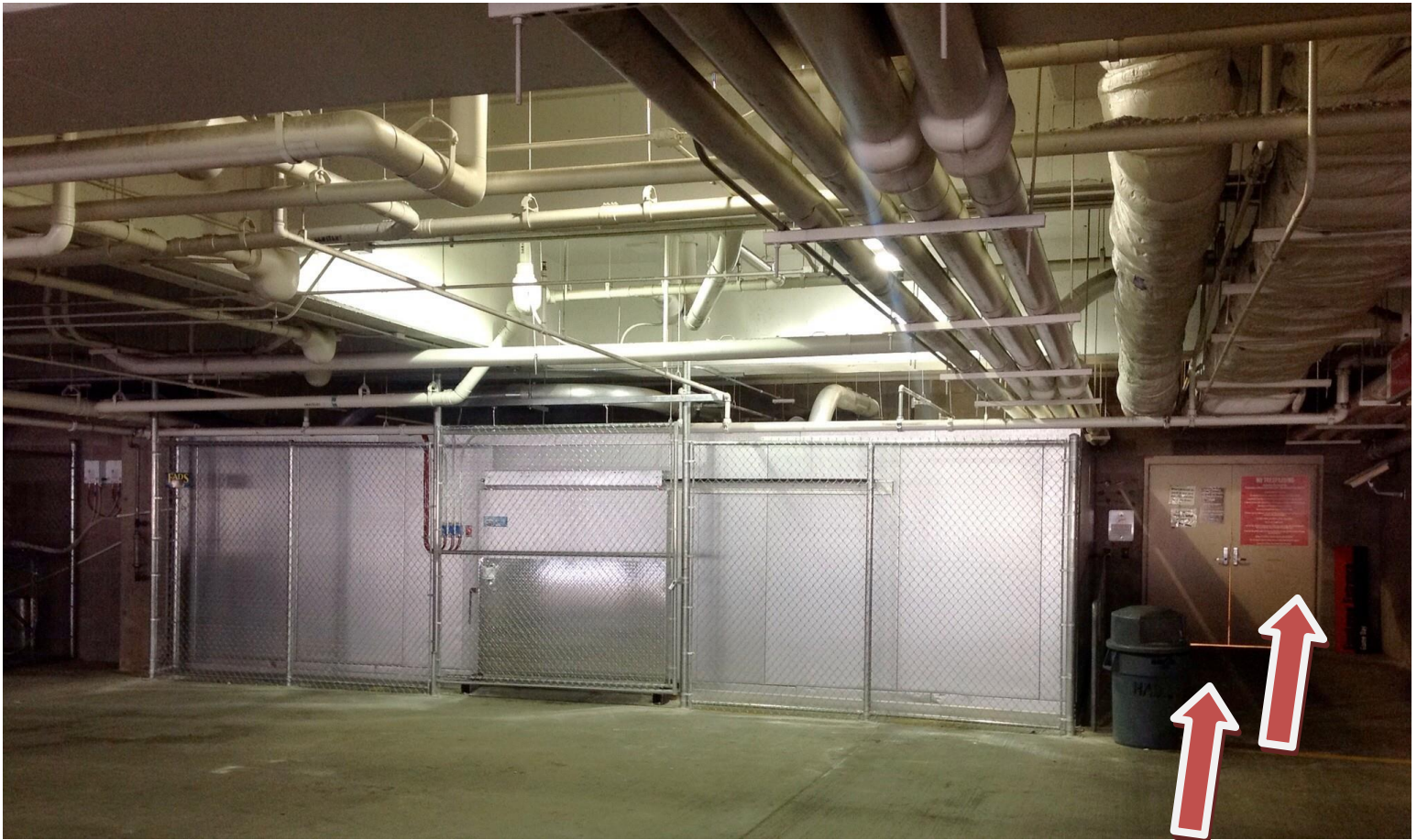
MEZZANINE EMPLOYEE ENTRANCE – PARKING GARAGE LEVEL P1